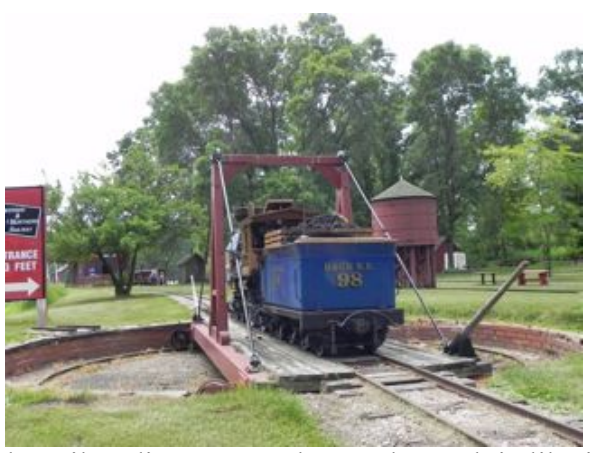
Engine house, water tank and turntable help make railroading as we who need nostalgia like it.