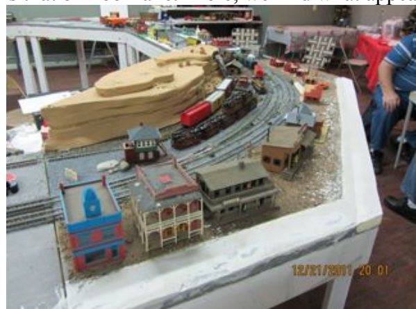
Rhinelander Railroad Association January 2012